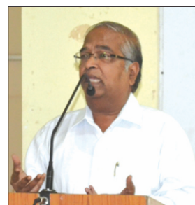
CA R.G. Tanksale