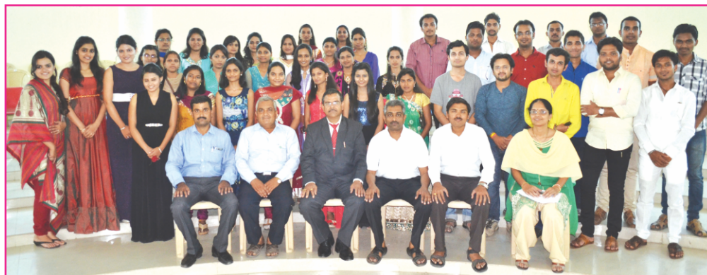
A team of young executives ready to take challenge of commerce and industry.