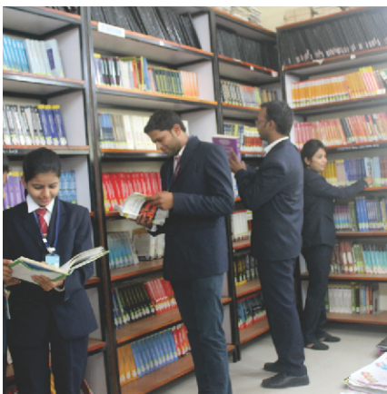
Central Library-open Access