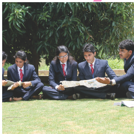
Group discussion on lush green laun