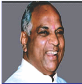
Hon'ble Sharadchandraji Pawar