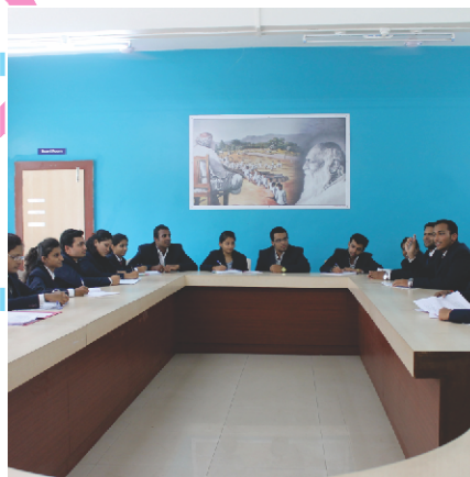
Conference Hall / Seminar Hall